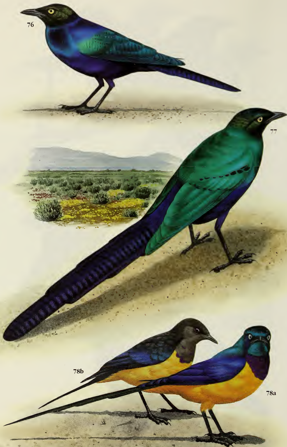
Plate 3. 76: Rüppell's Long-tailed Glossy Starling Lamprotornis purpuropterus . 77: Long-tailed Glossy Starling Lamprotornis caudatus . 78: Golden-breasted Starling Lamprotornis regius (a = adult, b = juvenile).